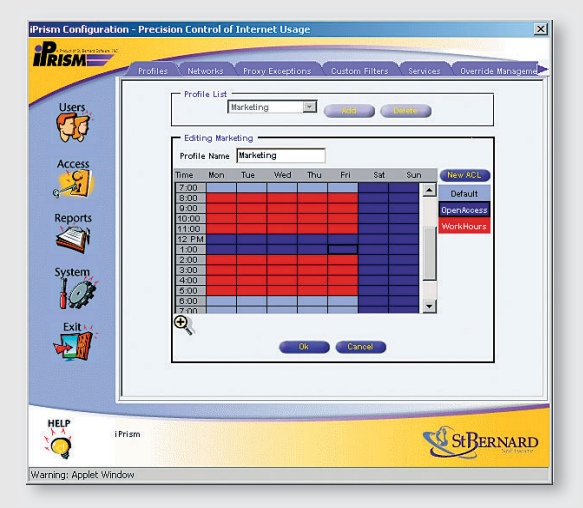
Easily enforce policies by day and time